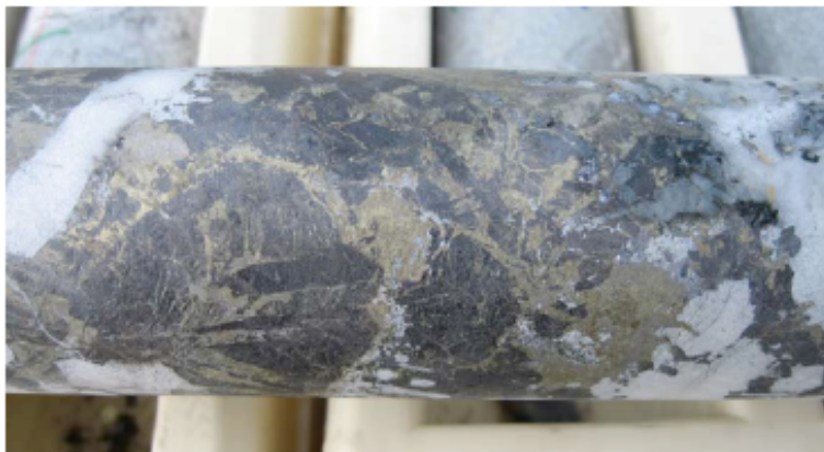
An example of high grade ore found at Conrad.

The most recent drill results have been very encouraging, with one hole showing a silver equivalent grade of 5,600g/tonne, consisting of 1.17m @ 1,715g/t silver, 3.9% copper, 16.1% lead, 5.0% zinc, 3.4% tin and 79g/t indium. The first clues on the size and quality of the mineralisation at Conrad will be evident when an initial resource estimate is released in November.